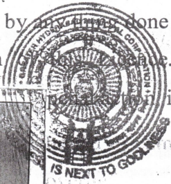
Specimen Signature of the Licensee

Signature of the Licensing Authority Addl. Chief City Planner G.H.M.C (HO) Hyd.