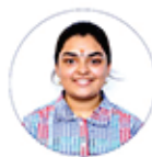
Dhatri K V 537 / 720