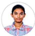
Sreshtha A 511 / 720