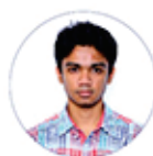
Adisatva P 680 / 720