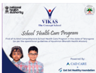
Student Health Care Program

Awakened Citizens Program (ACP) training was provided to teachers at RamaKrishna Matt, Hyderabad on 24th and 25th July 2023 as a CBSE initiative to inculcate values among children and enhance life skills for younger generation